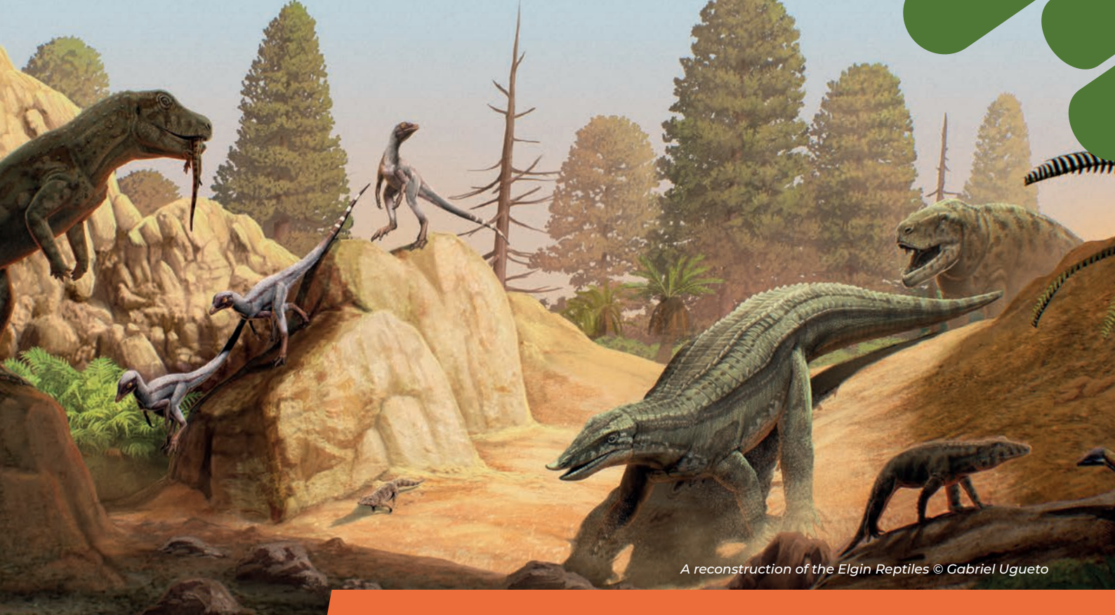
A reconstruction of the Elgin Reptiles © Gabriel Ugueto

the extinction, many of which still have descendants living today. The Triassic Elgin fauna include some of the oldest ancestors and cousins of crocodiles, lizards, dinosaurs (and therefore birds) and pterosaurs. “The Elgin Reptiles are important windows into the past, which tell us about the very origin of modern faunas,” says Davide.