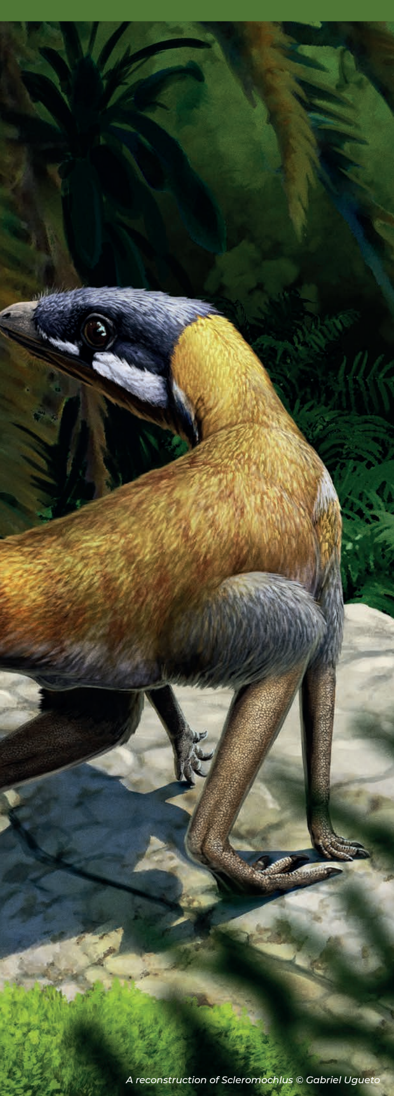
A reconstruction of Scleromochlus © Gabriel Ugueto